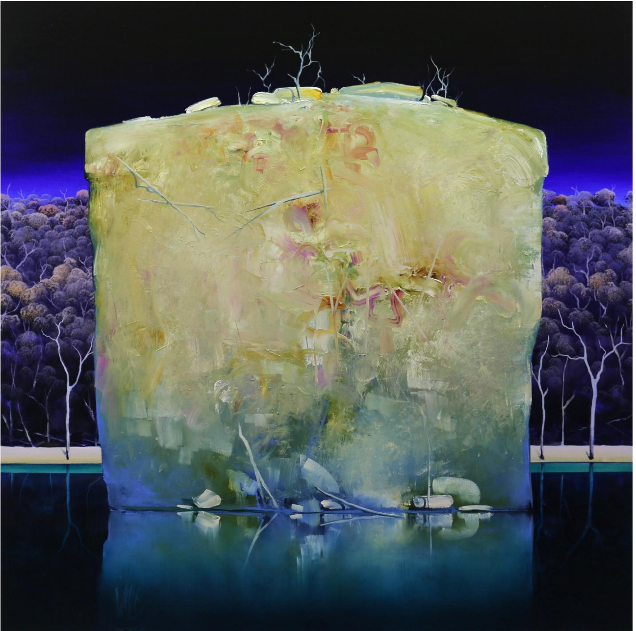
DAYDREAM Oil on linen | 122 x 122 cm