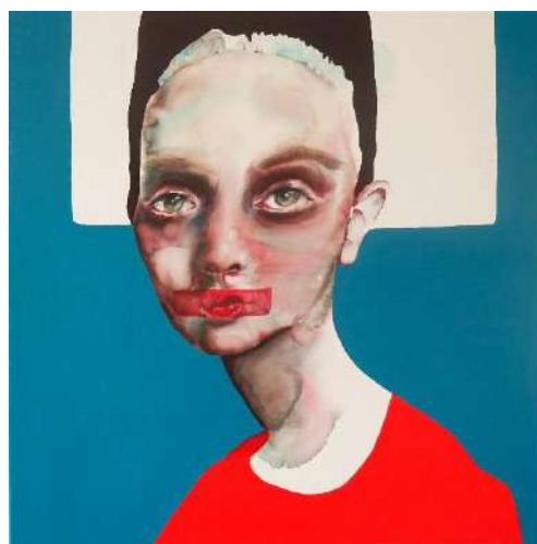
AP XI | $4200 AUD Acrylic and watercolour on canvas | 90 x 90 cm