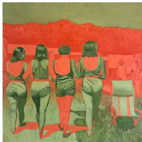
BEACH BUMS | $8900 AUD Oil on canvas | 100 x 100 cm