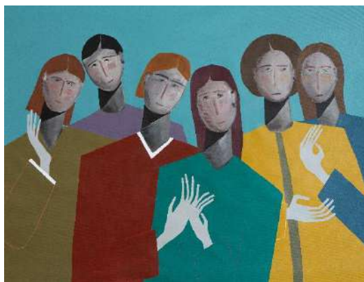
DANCE IN THE DUSK | $4500 AUD Acrylic on canvas | 120 X 90 cm