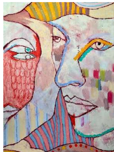
SILENT | $9100 AUD Acrylic & oil pastels on canvas | 120 x 90 cm

WHY WE LOVE IT? Strikingly 'feminine' subjects each with their own character, punctuated with pattern and recurrent design elements. Illustrative, confident execution.