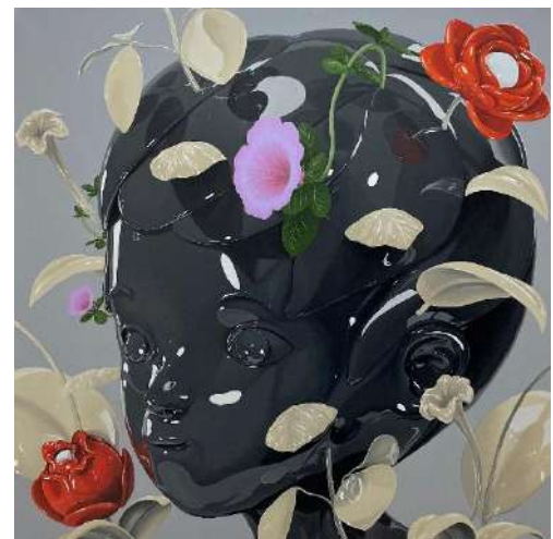
SYNTHETIC INNOCENCE | $2900 AUD Acrylic on canvas | 100 x 100 cm