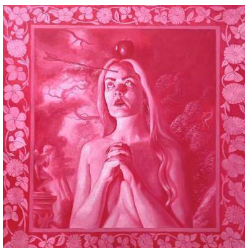
THE FOOL | $7250 AUD Oil on canvas | 100 x 100 cm