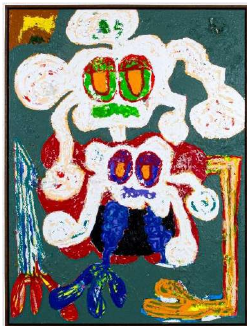
VALANDRIA | $5800 AUD Mixed media on canvas (Framed) | 120 x 90 cm

WHY WE LOVE IT? Narrative rich work laced with modern iconography. Vibrant and contemporary spin on early Figuration.