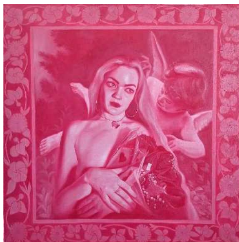
THE LOVER | $7250 AUD Oil on canvas | 100 x 100 cm

WHY WE LOVE IT? Ethereal, bewitching, translucent aesthetic loaded with self-inquiry.