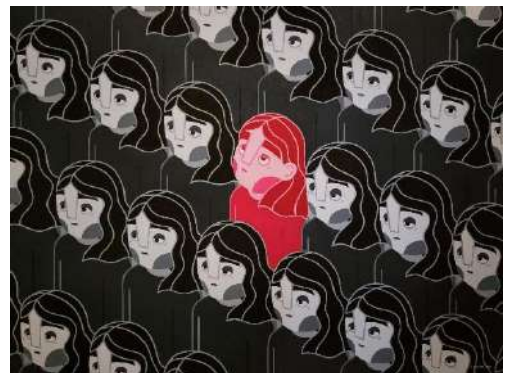
DON'T FORGET TO LOOK UP | SOLD Acrylic on canvas | 122 x 92 cm

WHY WE LOVE IT? Vivid and narrative rich imagery with a consistent and clear voice. Clever use of comedic deflection to soften real, raw and relatable topics.