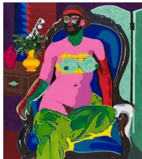
FEMME ASSISE | $9900 AUD Oil, Acrylic, acrylic ink on linen | 140 x 120cm

WHY WE LOVE IT? Dynamic compositions with distinctive 'Matisse' flavour. Large scale work in raw colours with brash storylines matched by crude yet confident lines.