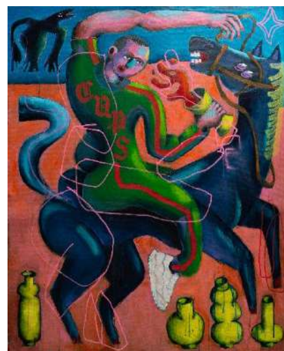
LA FORCE | $5800 AUD Mixed media on canvas | 118 x 97 cm

WHY WE LOVE IT? Art Brut aesthetic that is uncharacteristically tempered. Urban style that has grace and beauty about it. Strong semblance with iconography and symbology.