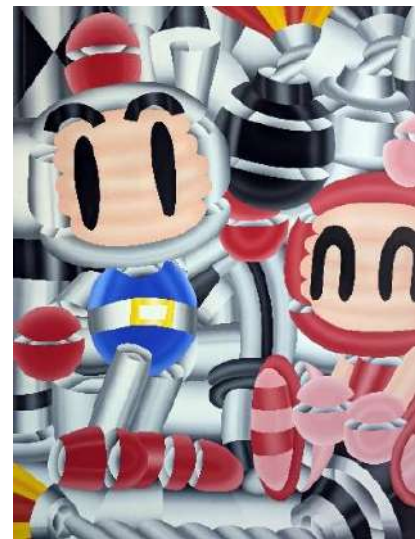
EXPLOSIVE STRATEGY | $7700 AUD Acrylic on canvas | 120 x 90 cm

WHY WE LOVE IT? Futuristic yet familiar subjectivity. Whispers of classic cubism with elegant technique and complex design. Entertaining and confident artistic voice