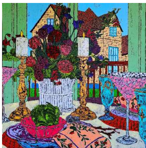
CANDLELIGHT | $3900 AUD |

$3900 AUD | Encaustic wax, mixed media on canvas | 100 x 100 cm