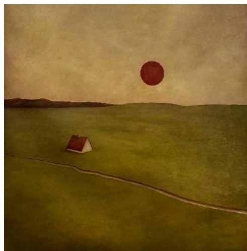
CASA CON CHIMENEA | $6990 AUD Oil on canvas | 100 x 100 cm

WHY WE LOVE IT? Grounded and spacious. Soft yet secure. Incites opportunity for serenity and beingness in a world seduced by competition and brash. Simply, feels lovely to be present with.