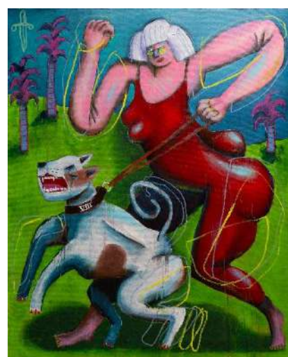
CUPS | SOLD Mixed media on canvas | 118 x 97 cm