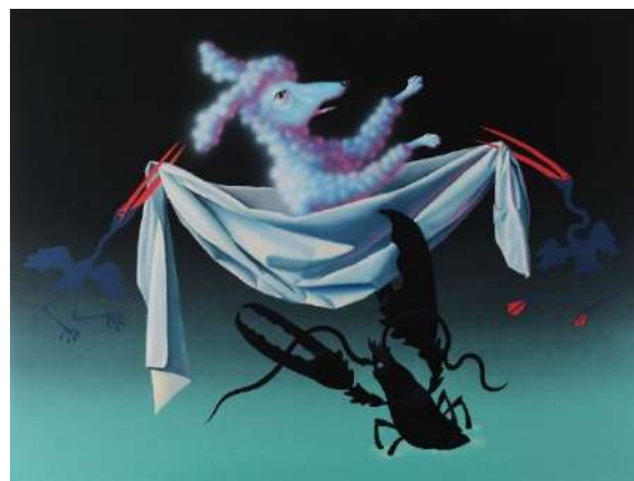
DINNER PLANS II | $7000 AUD Oil and acrylic on canvas | 120 x 90 cm