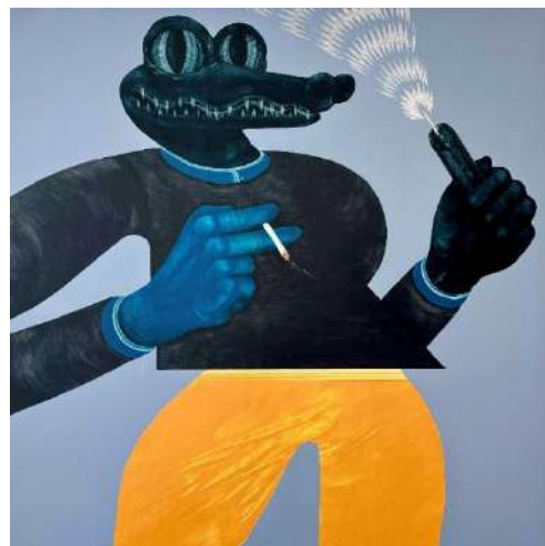
GATOR THE DETONATOR | $5950 AUD Oil on canvas | 100 x 100 cm

WHY WE LOVE IT? Preeminent example of artistic voice and mastery of style. Assertive use of medium and technique. Simple subjectivity and aesthetic, to dramatic affect.