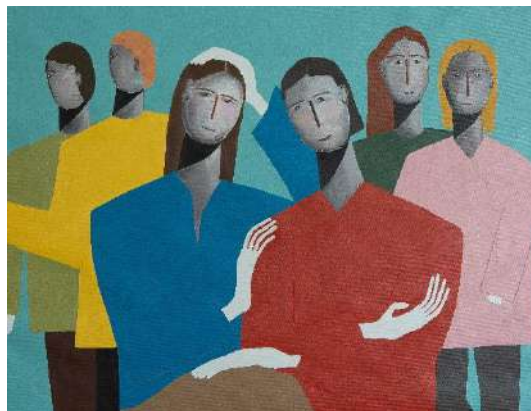
AFTER TALKINGS | $4500 AUD Acrylic on canvas | 120 X 90 cm

WHY WE LOVE IT? Emotive, interpersonal and intimate. Minimal aesthetic with broad appeal. Viscerally engaging.