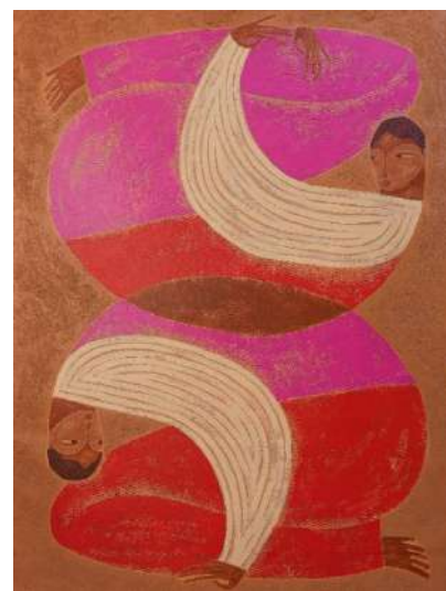
LEAN ON | $3500 AUD Mixed media on canvas | 120 x 90 cm

WHY WE LOVE IT? Textured, fluid, and earthy with echoes of ancient-culture and the past.