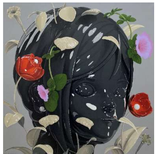
PLASTIC EMOTIONS | SOLD | Acrylic on canvas | 100 x 100 cm

WHY WE LOVE IT? Clever, technical, fantastic and thought provoking. Irresistibly tactile aesthetic and sensory detail.