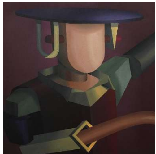
SILENT RHYTHM | $3900 AUD Acrylic on canvas | 100 x 100 cm

WHY WE LOVE IT? Artistic approach loaded with aplomb that translates to the work. Strong voice with narrative diversity, broadening relatability. Mysterious subjects that feel enlivened by a collective life force.