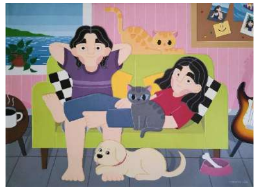
GOOD MORNING | $3500 AUD Acrylic on canvas | 122 x 92 cm

CAREER HIGHLIGHTS | Entering private collectors' markets in Asia. Mastering clarity and composition during her career and assimilating her refined graphism skills into her studio work.