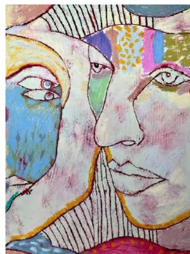
PROUD | $9100 AUD Acrylic & oil pastels on canvas | 120 x 90 cm