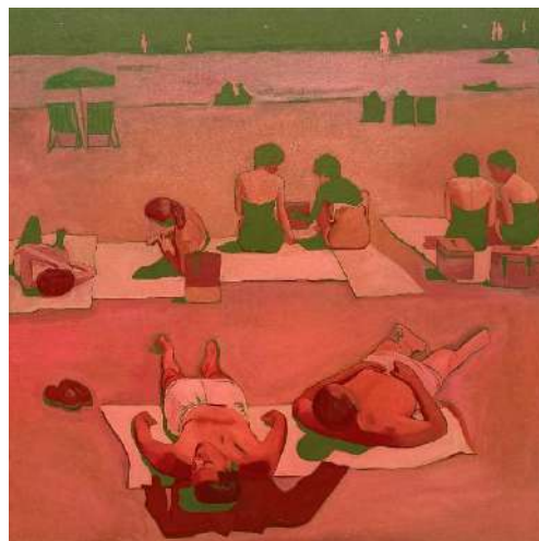
SUN SEEKERS | $8900 AUD Oil on canvas | 100 x 100 cm

WHY WE LOVE IT? Vintage vibes with “photography-negative and dark room” aesthetic. Engaging, delightful and dynamic imagery that is both decorative and masterful. Celebration of life in the South.