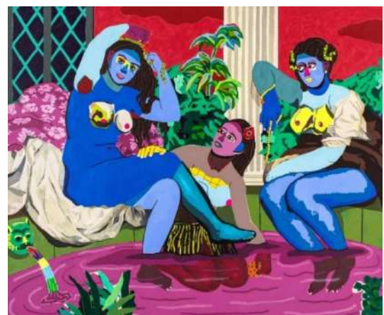
THE BATH | $15500 AUD Oil, Acrylic, acrylic ink on linen | 150 x 180 cm