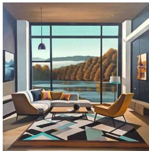
ON THE RIVER 1 | $6700 AUD Acrylic on canvas | 100 x 100 cm

WHY WE LOVE IT? Evokes 'tranquil modernity' through harmonious colours and balance between natural and structural subjectivity. Graphic imagery with organic flair.