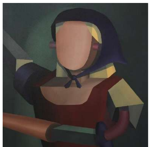
GRACE IN MOTION | $3900 AUD Acrylic on canvas | 100 x 100 cm