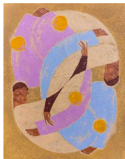
FUSION | SOLD Mixed media on canvas | 120 x 90 cm