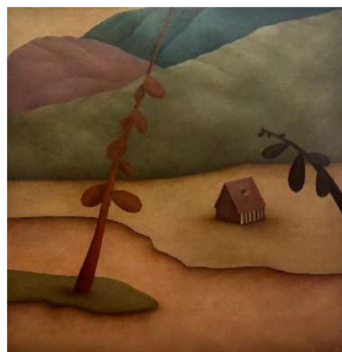
ENTRE MONTANAS | $6990 AUD Oil on canvas | 100 x 100 cm