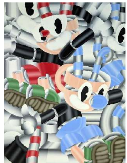
RUN & GUN REVERIE | $7700 AUD Acrylic on canvas | 120 x 90 cm