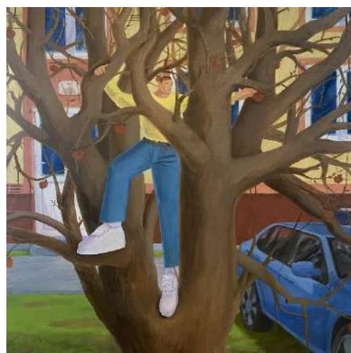
WINTER APPLES | $6200 AUD Oil on canvas | 100 X 100 cm