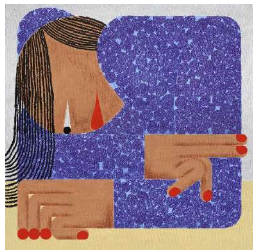
BOLAS 01 | $ 7700 AUD Acrylic and oil pastels on canvas | 100 x 100 cm

WHY WE LOVE IT? Crisp, flat imagery punctuated with personal flair. Blatant use of a youthful and vibrant aesthetic, matured by clear technical prowess and narrative bends toward collective consciousness.