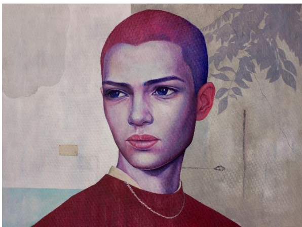
RYDER Acrylic on linen canvas | 90 x 120 cm | $6500