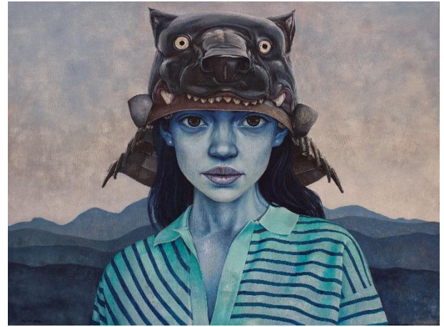
INGER Acrylic on linen canvas | 90 x 120 cm | $6500