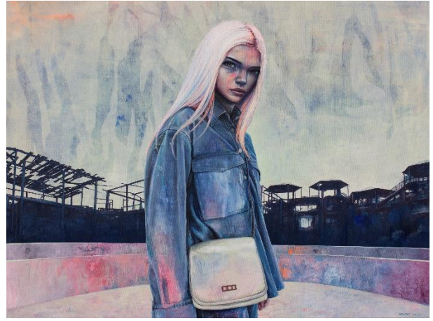
SOLISSA Acrylic on linen canvas | 90 x 120 cm | $6500