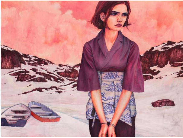
TRACES OF DAENA Acrylic on linen canvas | 90 x 120 cm | $6500