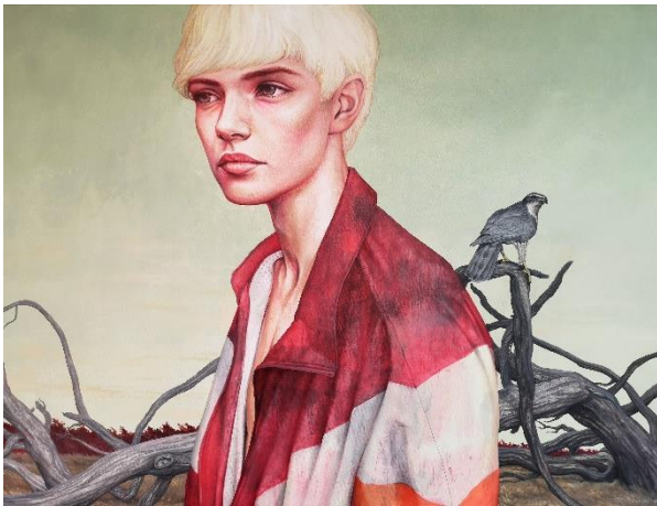
BOY AND THE HAWK Acrylic on linen canvas | 90 x 120 cm | $6500