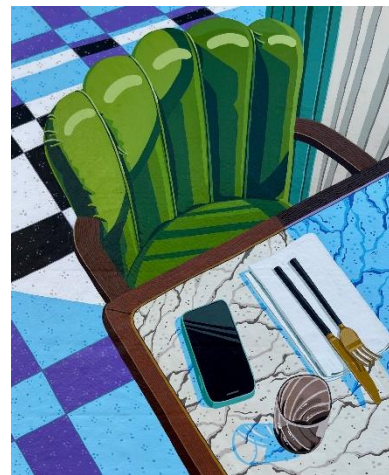
TABLE FOR ONE