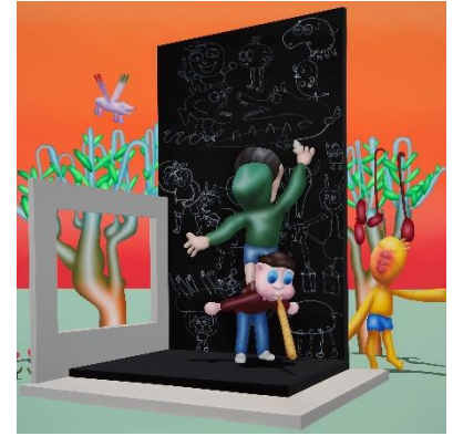
PIRI THE DREAMER AND FLYING COYOTE AMONG FRIENDS #40