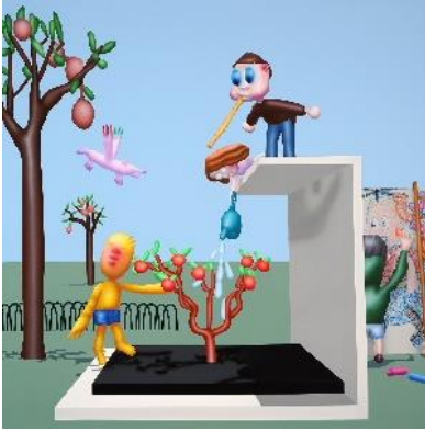
PIRI THE DREAMER AND FLYING COYOTE AMONG FRIENDS #38