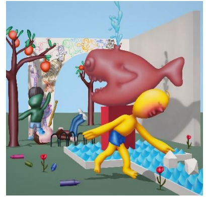
PIRI THE DREAMER AND FLYING COYOTE AMONG FRIENDS #43