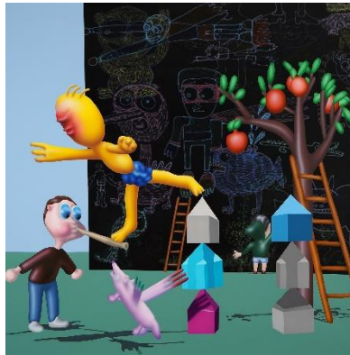
PIRI THE DREAMER AND FLYING COYOTE AMONG FRIENDS #41