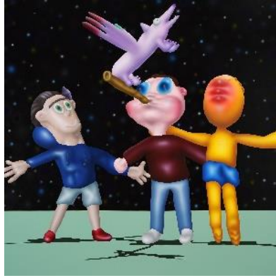
PIRI THE DREAMER AND FLYING COYOTE AMONG FRIENDS #39