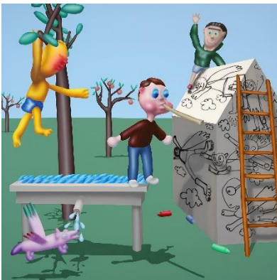
PIRI THE DREAMER AND FLYING COYOTE AMONG FRIENDS #42