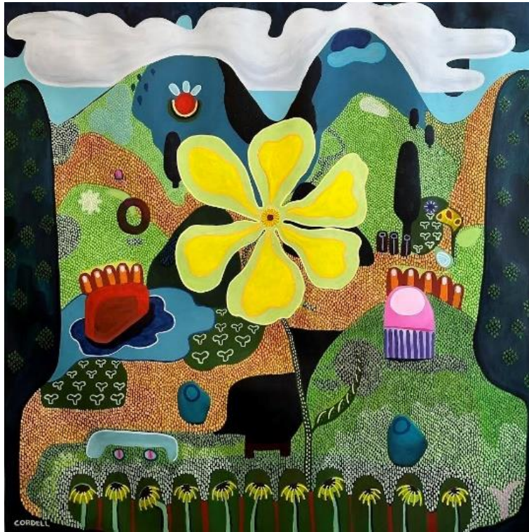
BIG FLOWER HEAD