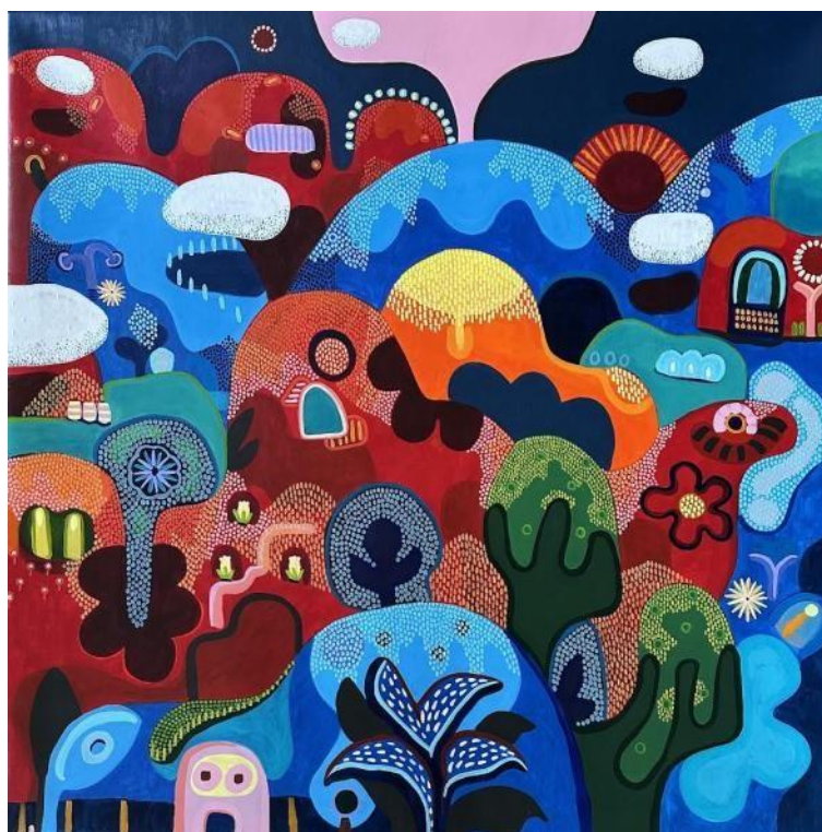
ON THE MOVE