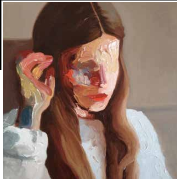
Palette - 2015, Oil on canvas