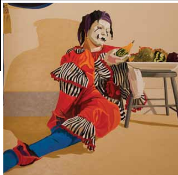
Is that trembling cry a song? - 2011 Oil on Canvas, 130cm X 140cm

Drinks + Nibbles provided. RSVP by email or phone by 2nd July.