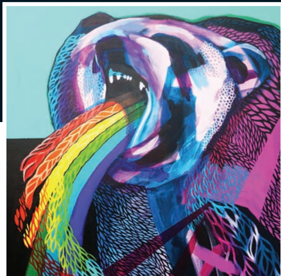
Dream Eater – 2011 (detail), Acrylic on canvas, 60 x 75 cm