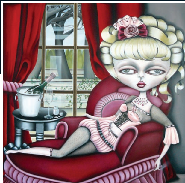
Sleeping Beauty - 2011 (detail), Oil on canvas, 120 x 90 cm

Drinks + Nibbles provided. RSVP by email or phone by 23rd April