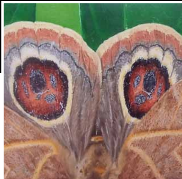
Automeris 1 - 2010, Oil on canvas, 33 x 40 cm