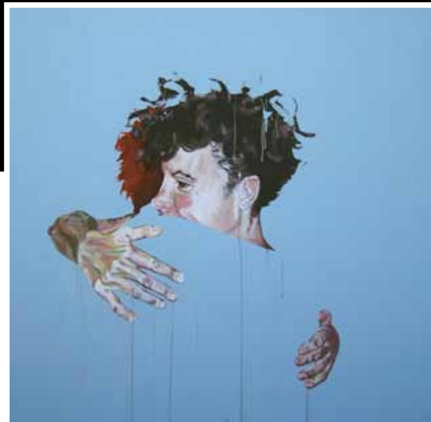
Here - 2010, Acrylic on canvas, 122 x 122 cm