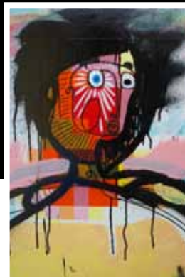
Peter Drew The Man on the Bus 2010, Acrylic and aerosol on canvas, 100 x 140 cm