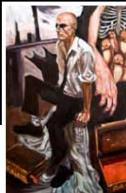
Rohan Fraser The Sit Down 2011, Oil on canvas, 122 x 152 cm