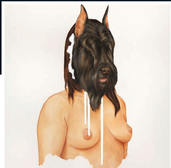
Schnauzer Graff - 2010, Oil on canvas, 76 x 91.5 cm