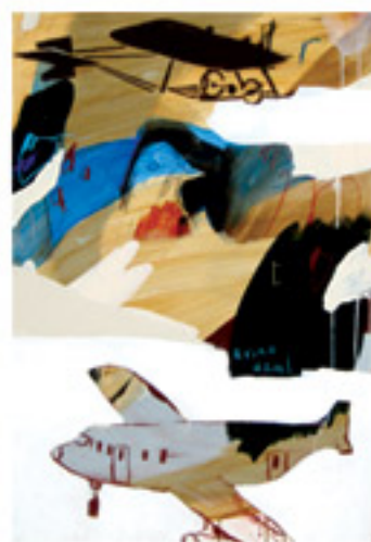
Take a Ride, 2009