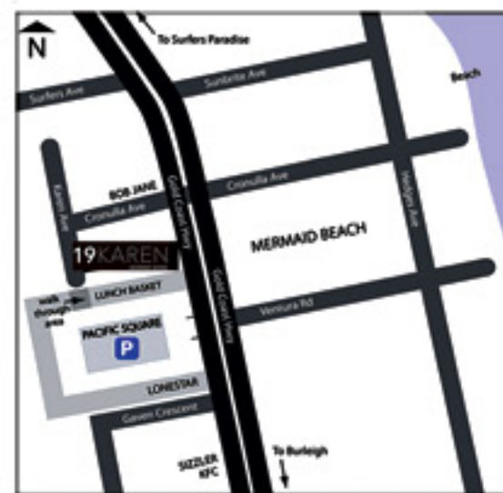
Parking avail. at Pacific Square, off GC H'way