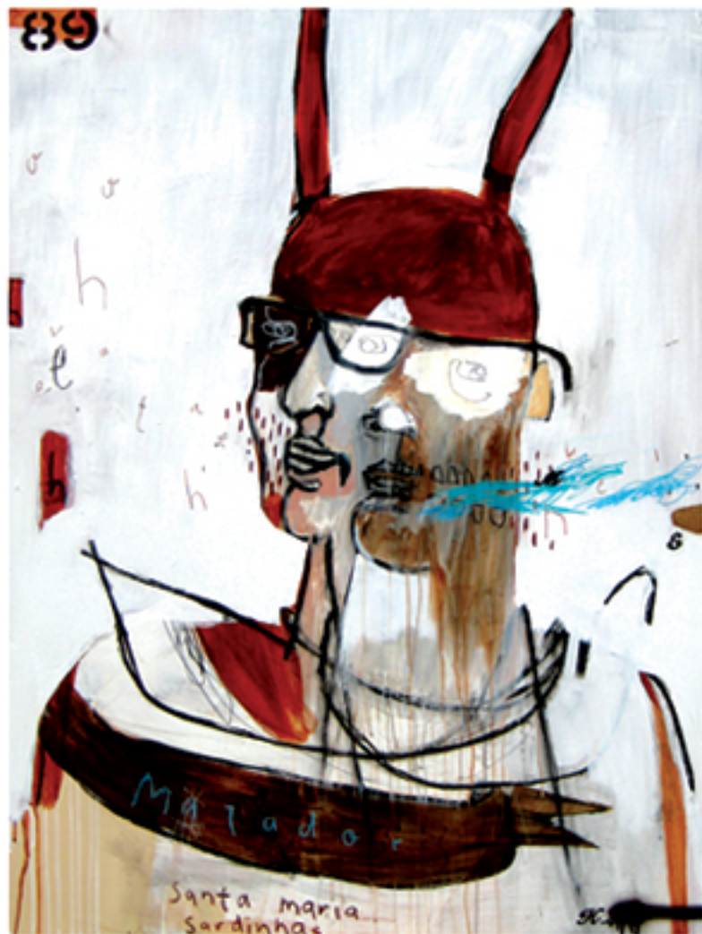
Portuguese Matador, 2009

View exhibition online: www.19KAREN.com.au